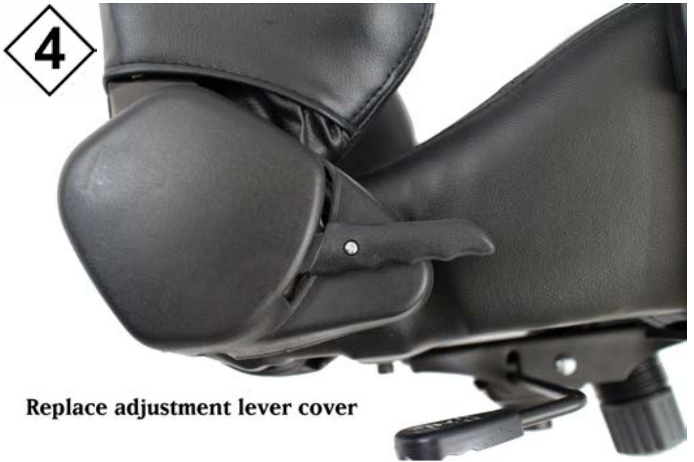
Replace adjustment lever cover